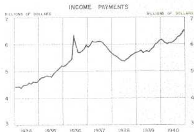
U. S. Department of Commerce estimates of the amount of income payments to individuals, adjusted for seasonal variation. By months, January 1934 to December 1940.