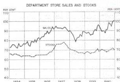
Indexes of value of sales and stocks, adjusted for seasonal variation, 1923-1925 average = 100. By months, January 1934 to December 1940.