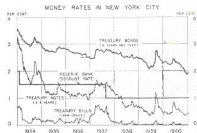
For weeks ended January 6, 1934 to January 11, 1940.